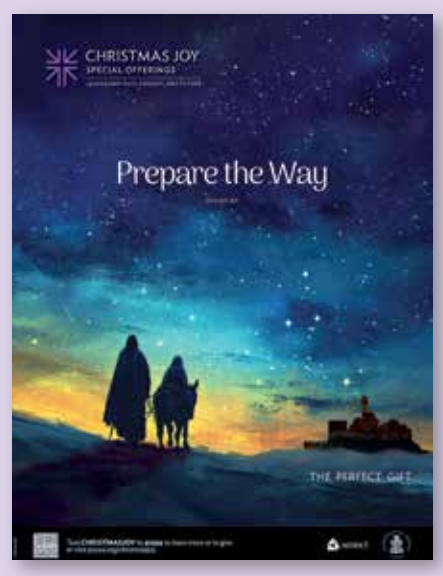
Prepare the Way poster