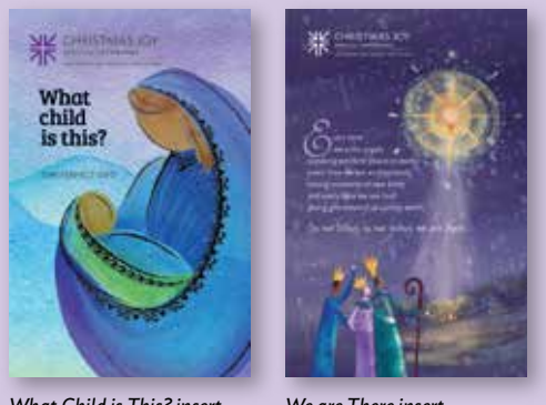
What Child is This? insert